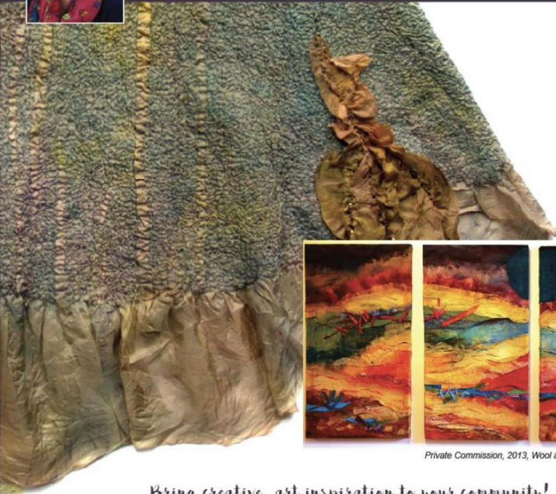
Shorelines, 2012 Wool, Silk and Beads

Fiber Artist and Educator ... mingling art, agriculture and inspiration in the community.