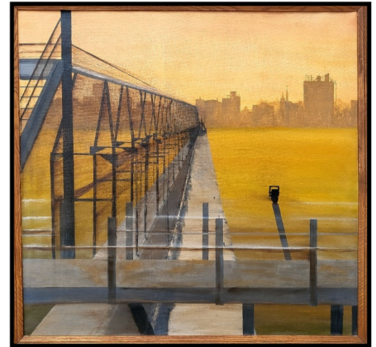
Waukegan Pier 1974