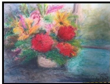
Valentine Bouquet from a Secret Admirer