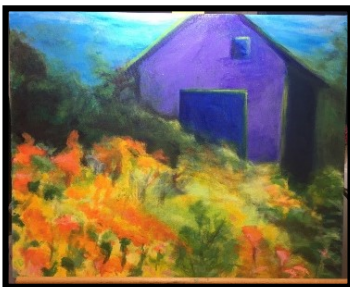
Summer at the Barn