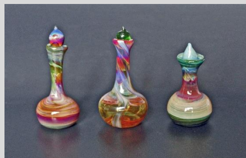
Perfume Bottles, lampworked glass by Logan Ghormley