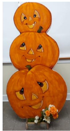
Right