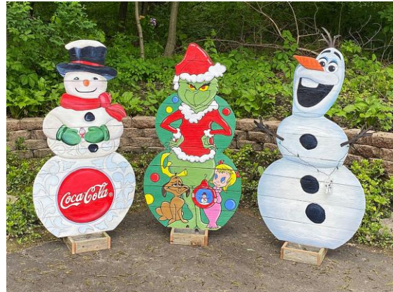
Left

AFAF artists participate in the Snowmen on the Chain (of Lakes) event. This event is a charity event launched by the Antioch Chamber of Commerce.