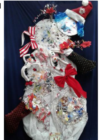
Left