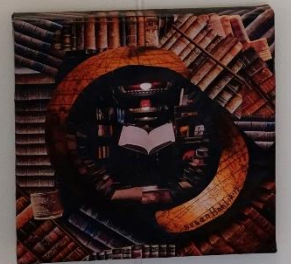
ARTIST: [unreadable] TITLE: [unreadable] MEDIUM: [unreadable] DATE: [unreadable]