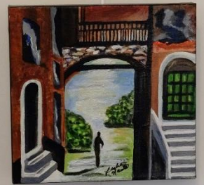
ARTIST: [unreadable] TITLE: [unreadable] MEDIUM: [unreadable] DATE: [unreadable]