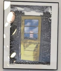
ARTIST: [unreadable] TITLE: [unreadable] MEDIUM: [unreadable] DATE: [unreadable]