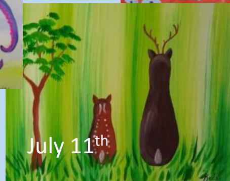
July 11 th

View upcoming classes on the AFAF website www.antiochfinearts.org