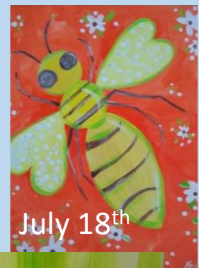
July 18 th