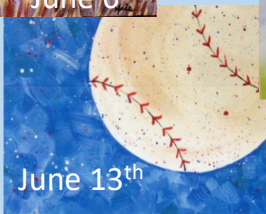
June 13 th