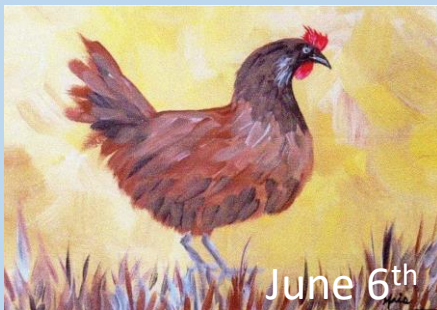
June 6 th