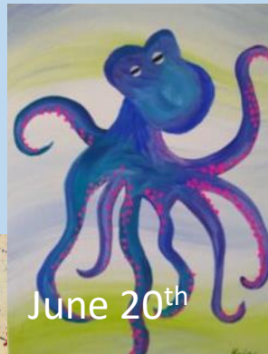
June 20 th