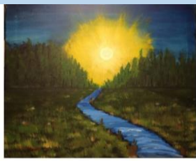
Blazing Sun w/ Don Muscarello