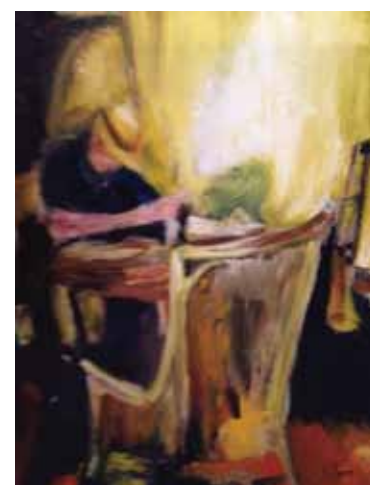
Door prize or raffle by Ken Lutgen

Parkway Banquets is located on Lake Shore Drive in Ingleside - a perfect location for your next banquet!