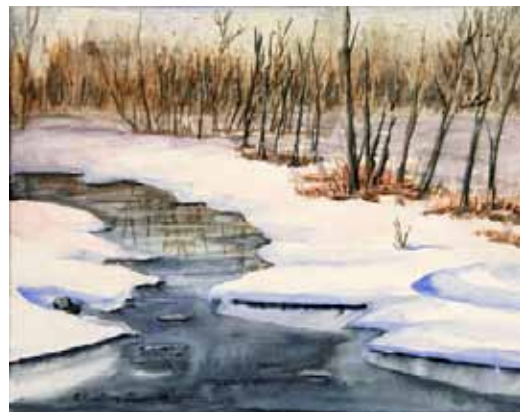
Winters Delight (Snow Scene Series)