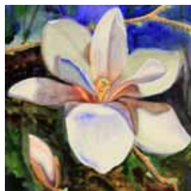
Magnolia 3D (Magnolia Series)