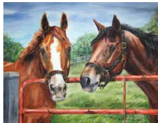
Friends at the Gate (Equine Series)