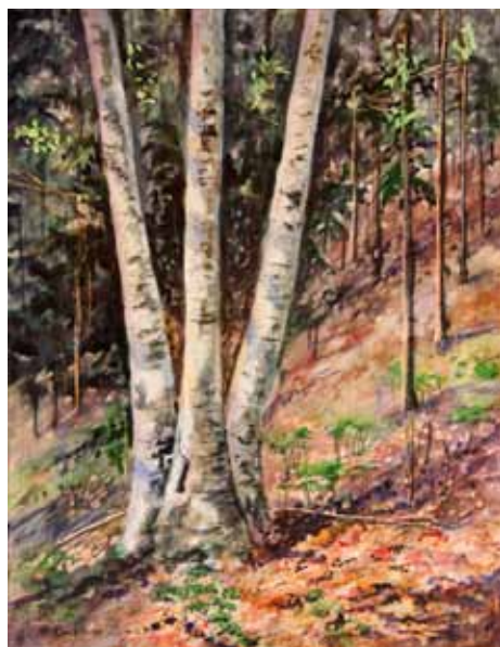
Hillside Birch (Birch Series)