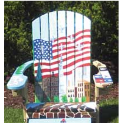
Welcome Home Chair

Executive Director, Antioch Chamber of Commerce and Industry