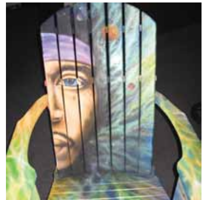
Jimi Hendrix Chair