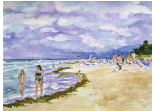
"After the Storm" Varadero Beach, Cuba