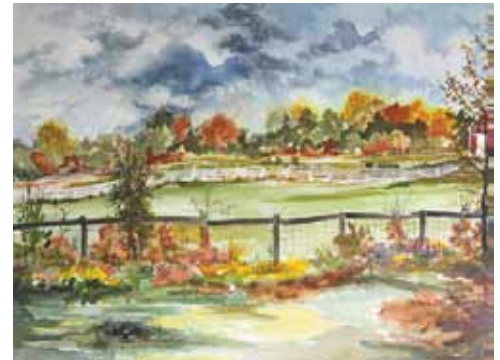
"Autumn" Full sheet Watercolor

Past participation in volunteer work for Grayslake Park District, Carmel High School, Street Scenes, Lake Shore Dance Company, Dance Workshop, New World Dance Company, PM&L Theater, Antioch High School, program coordinator for Lake County Chapter of National organization of Women in Construction.