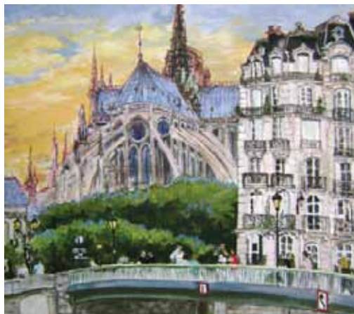
"Notre Dame at Sunset" Oil on Canvas